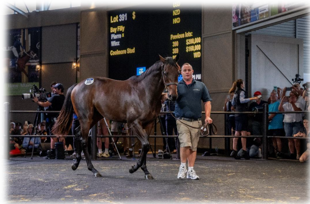
Winx foal in the sales ring